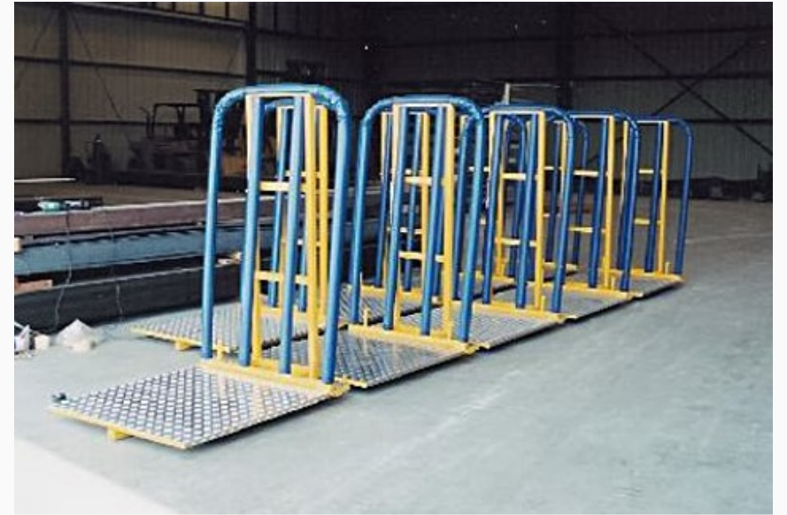
Platform for fork lifts