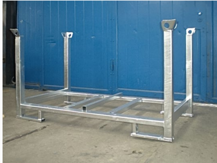
Transport pallet for props