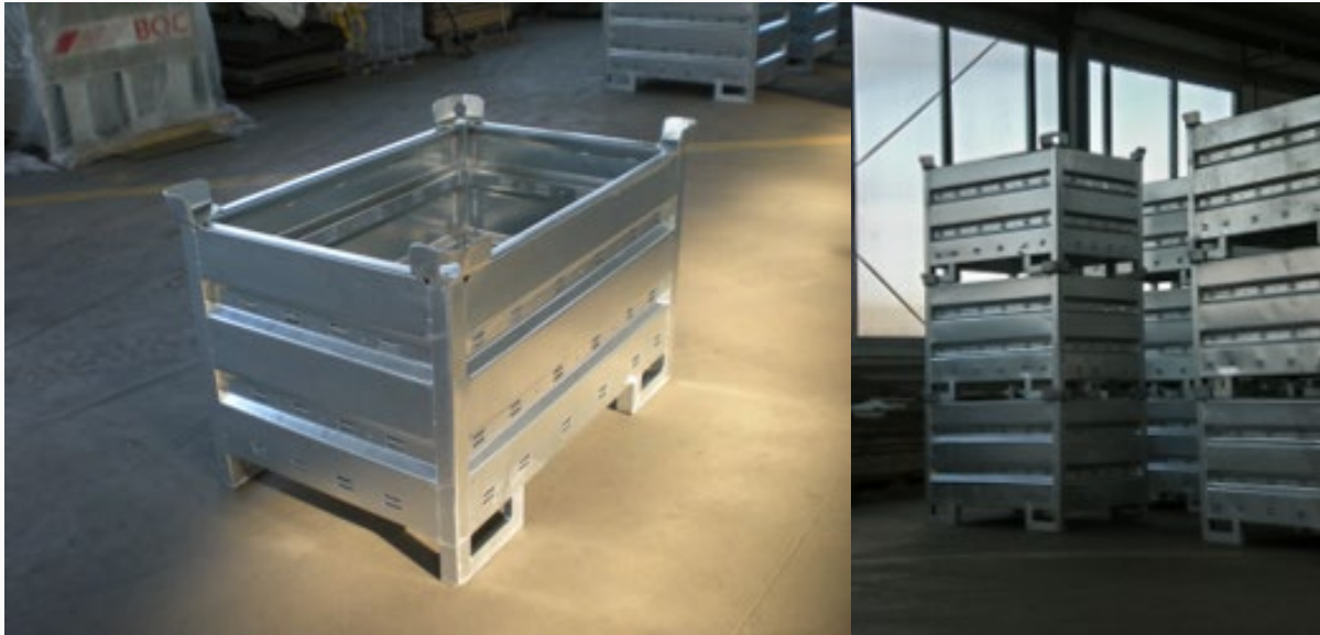
Building props transport pallet