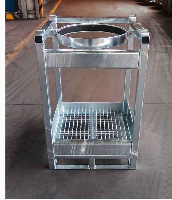
Steel frames for cylinders