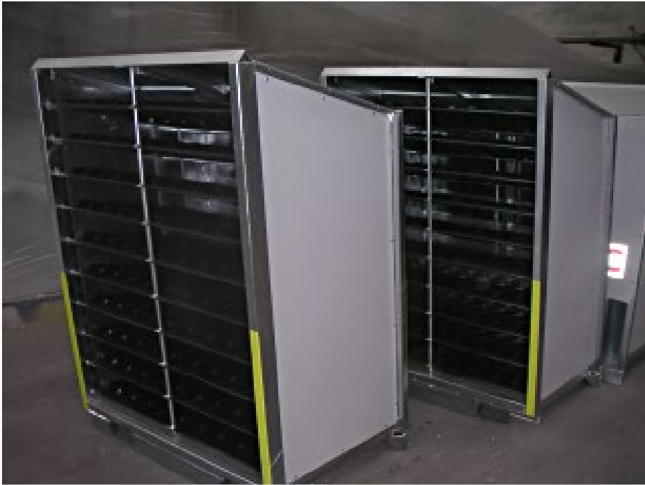
Medical cylinder transport pallet