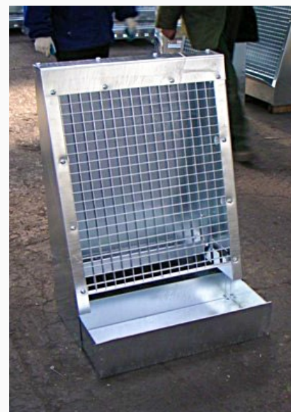
Box for car carpet's beating