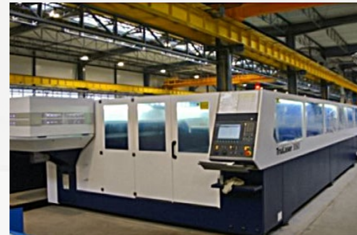
Laser Cutting Machine for plates