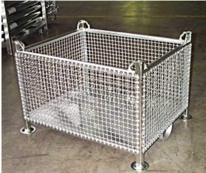
Crate for transit storage