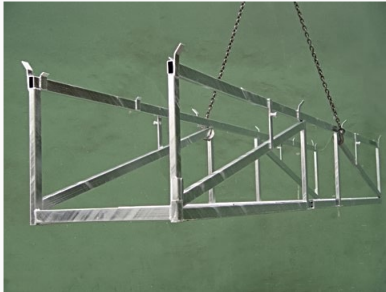
Pallet for windows profiles