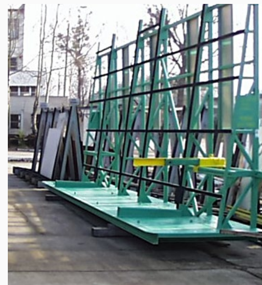
Glass transport pallet