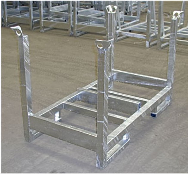
Building props transport pallet