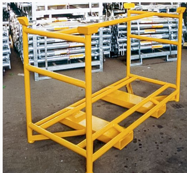
Car tyres transport pallet