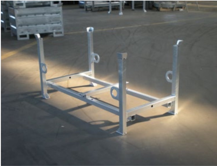
Building props transport pallet L x B x H = 1500 x 810 x 770 [mm] Net weight : 46,2 kg