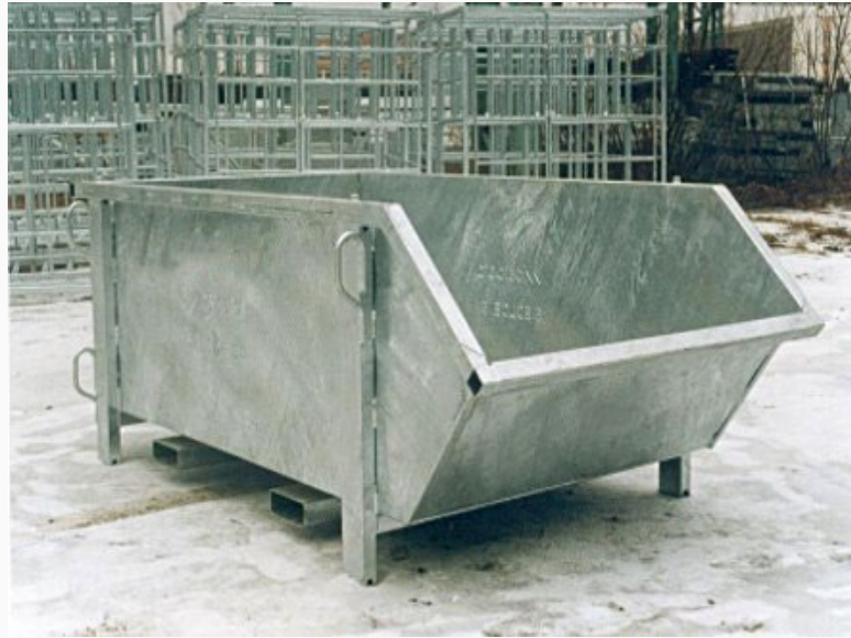
Containers for transporting and storage of construction materials