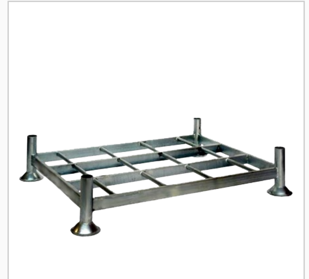
Building props transport pallet