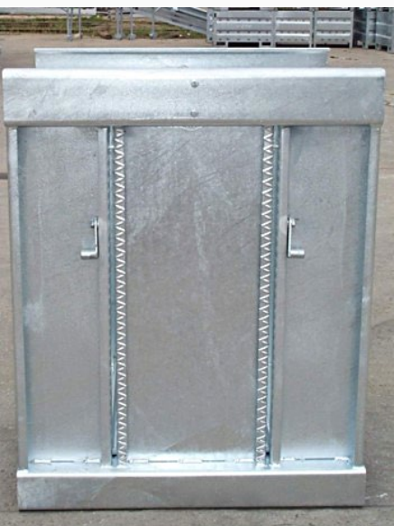
Container with openable flap