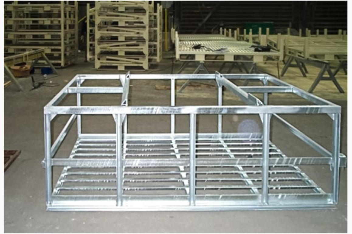
Pallet for transporting gas cylinders Weight – 280 kg