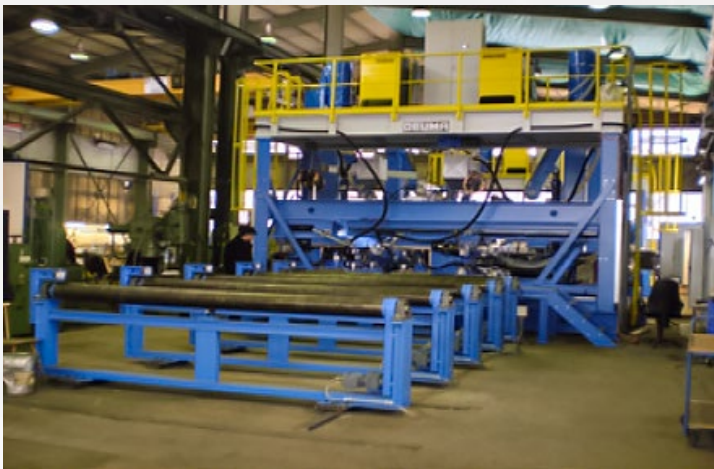
A modern line for production of welded profiles