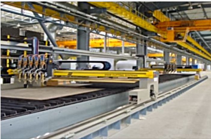
Two portal cutting machines for plates