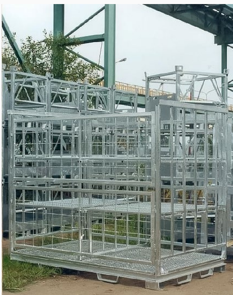
Pallet for tuna transport