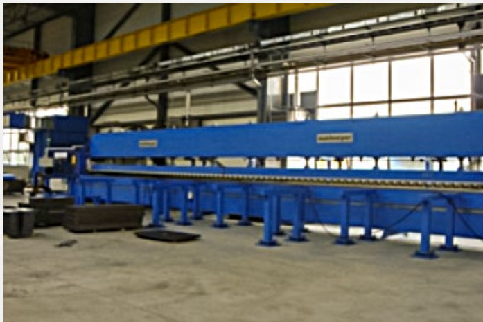
Universal Edge Beveller