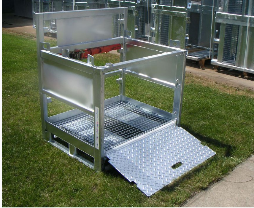
Steel pallets for gas cylinders