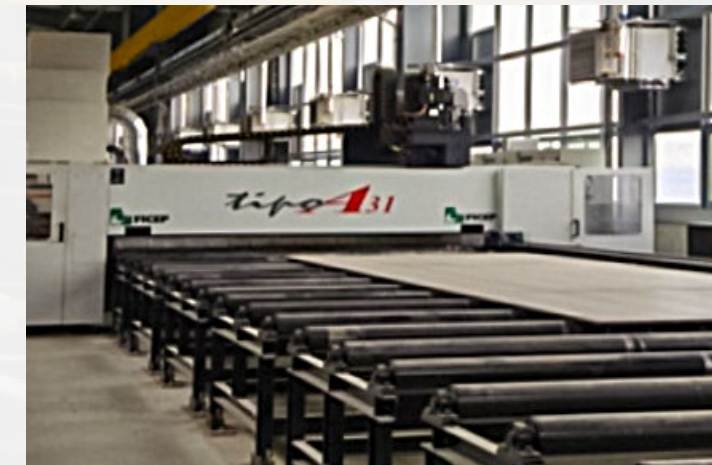
Automatic CNC Drilling & Thermal Cutting System for Large Plates