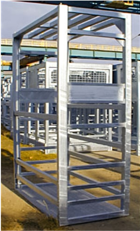
Gas cylinders transport pallet